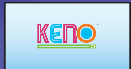
NEW KENO MONITOR